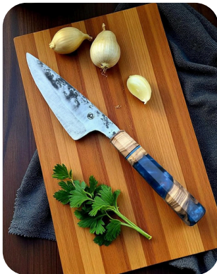
Japanese style chef knife