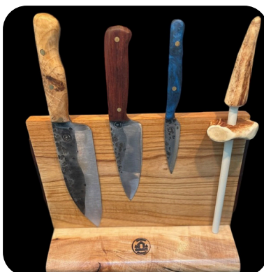
Kitchen knife set

All photos provided courtesy of Covered Bridge Forge. See and learn more at coveredbridgeforge.com