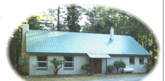
Remembering the old look

For more years than many of the members can recall entrance to the Community Center has been a 4 x 6 foot roof that offered no shelter from the weather and was so low in the front that several members had to duck to avoid hitting their head.