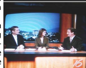
"I had a good time with the Vida folks"