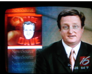
On the air, August 15th