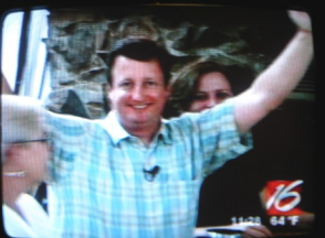
"OK, but only if my wife can play too"