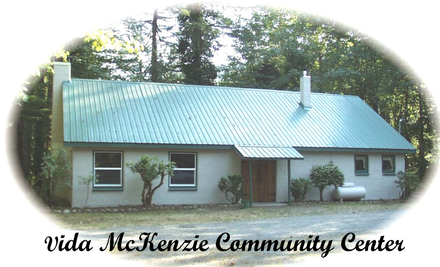
Vida McKenzie Community Center